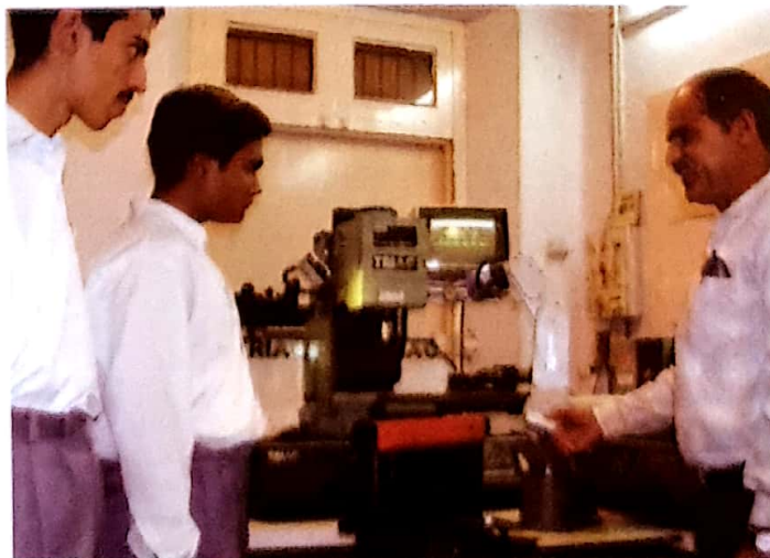
CNC & Robotics Laboratory

The Mechanical Engineering programme offers specialization in Design Engineering, Industrial & Production Engineering, and Thermal Engineering through a wide spectrum of elective subjects. Students gain ample exposure to CNC programming, Robot programming, development of Decision Support Systems, and simulation through the SIMAN/Cinema, ARENA, QUEST, NISA and FORGE2 simulation packages.