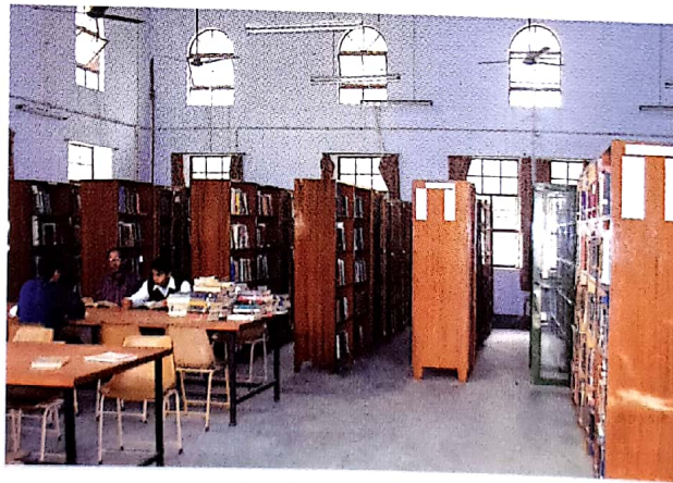
The Faculty of Engineering Library

Several graduates from the Faculty are working in top notch IT companies such as Adobe Software, HCL Infosystems, Hughes Software Systems, Infosys, Satyam Computers and WIPRO. Several alumni are employed with BARC, Cummins, General Motors, Hyundai, Intel, IOCL, Kelvinator, LG Electronics, Lucent Technologies, Maruti Udyog, Motorola, NTPC, ONGC, Philips, Schlumberger, ST Microelectronics, Texas Instruments, Voltas and Yamaha Motors. Many graduates are working in R&D organizations such as ADRDE, DRDO etc, and in educational institutions including the IITs, NITs, and universities abroad.