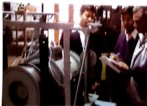
Electrical Machines Laboratory

The highly qualified and dedicated faculty is actively involved in teaching and research and regularly publishes papers in journals of international repute. Several of them have been awarded prestigious awards at the national level.