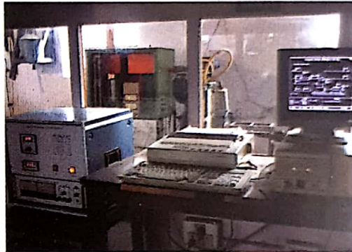
IC Engines Laboratory