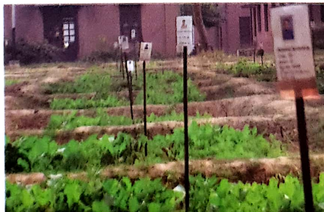
Students' plots for Agricultural Operations