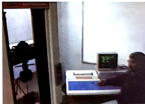
Material Testing Laboratory